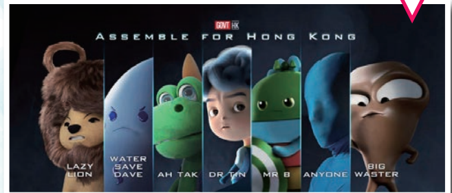
Dr Tin and Other Government Mascot Forming "Assemble for HK"

In late April, the Observatory's "Dr Tin" collaborated with "Big Waster" from the Environmental Protection Department, "Ah Tak" from the Food and Environmental Hygiene Department, "Anyone" from the Fire Services Department, "Mr B" from the Agriculture, Fisheries and Conservation Department, "Water Save Dave" from the Water Supplies Department, and "Lazy Lion" from the Department of Health to form the "Guardians". Related posts on the Facebook pages of these departments were very popular, helping to raise public recognition of government services and mascots.