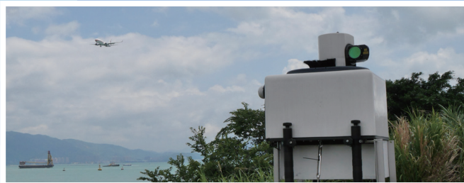
Short-range LIDAR near the north runway of the airport

With the continuous development of the airport, the turbulence that may be caused by buildings near runways has gained attention. In this regard, the Observatory has been actively developing alert technology, and set up a short-range LIDAR near the north runway. This LIDAR came into service at the end of July and can perform finer and more frequent scans to capture turbulence features of smaller spatial and temporal scales induced by nearby buildings, to improve the warning service and assure aviation safety.