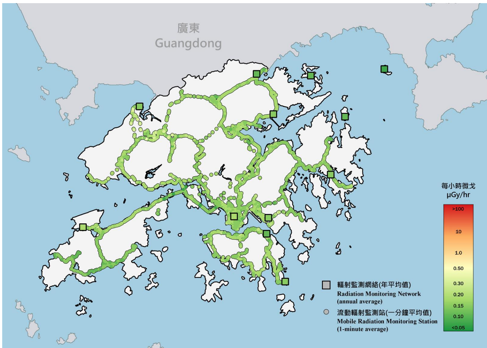
圖 4. 二零一七年： (i) 流動輻射監測站於巡測路線上錄得的环境伽馬劑量率及(ii) 輻射監測網絡錄得的全年平均环境伽馬劑量率。