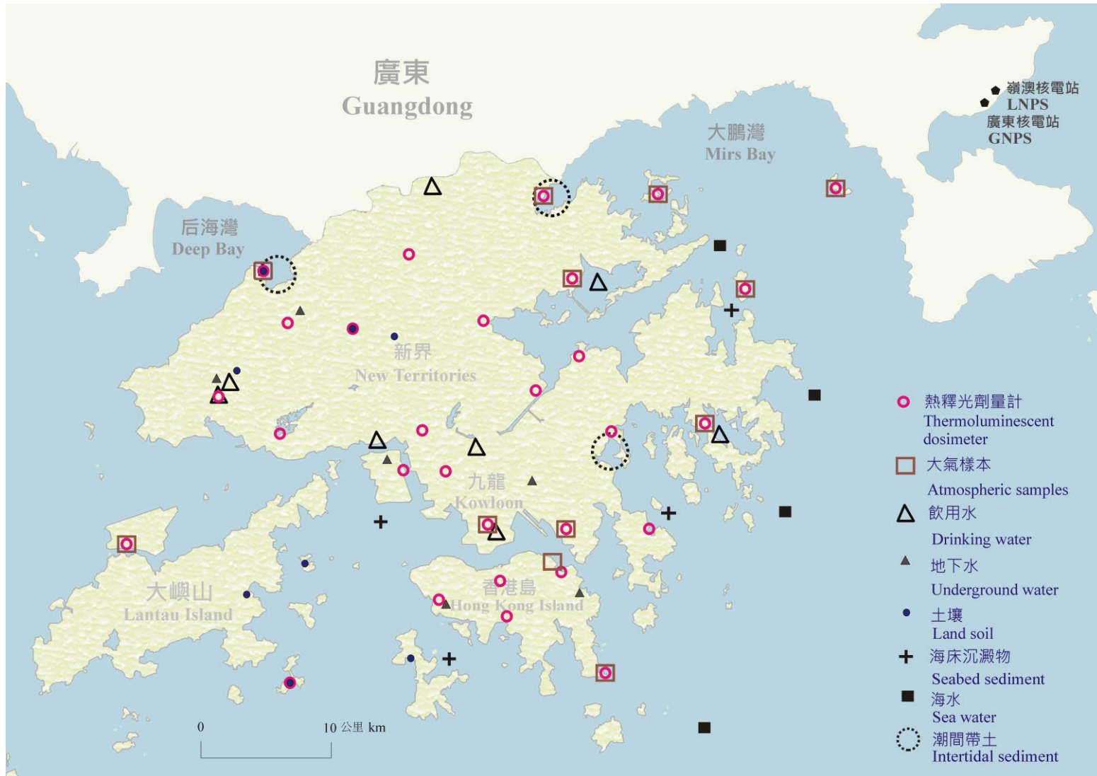
圖 2. 熱釋光劑量計網絡及二零一七年環境樣本收集點。 Figure 2. Thermoluminescent dosimeter network and locations for collection of environmental samples in 2017.