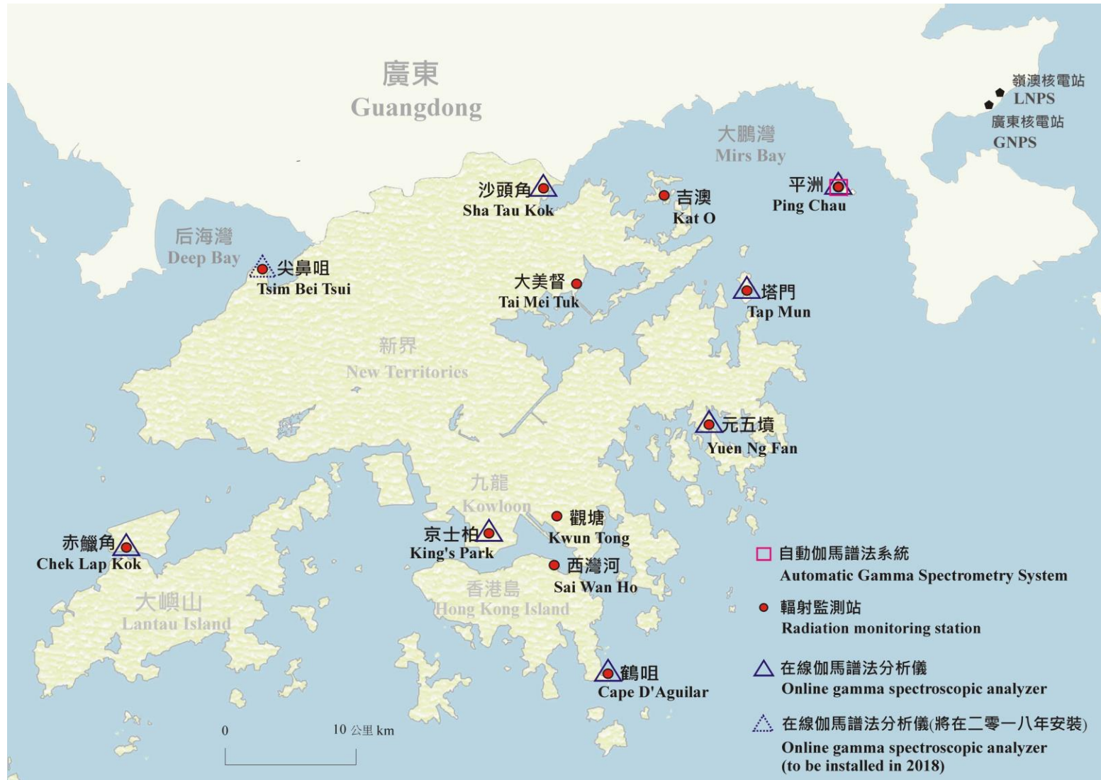
圖 1. 二零一七年實時監測環境輻射的測量點。