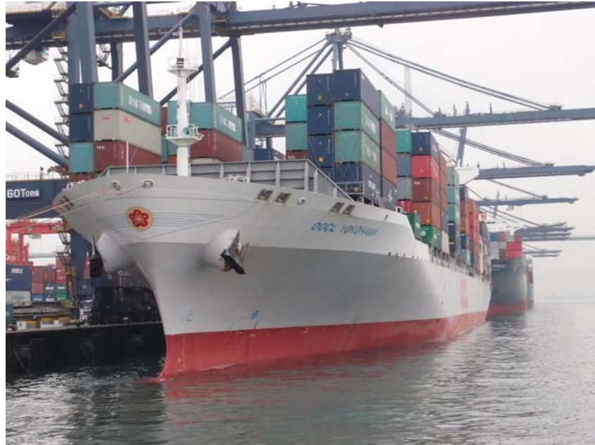
OOCL Yokohama – the first Hong Kong VOSClim

To meet this demand, the Hong Kong Observatory (HKO) has also recruited the first Hong Kong VOSClim - OOCL Yokohama in April 2013. HKO will continue to recruit more VOSClim for further contribution to the safety operation of the marine community and the monitoring of climate change.