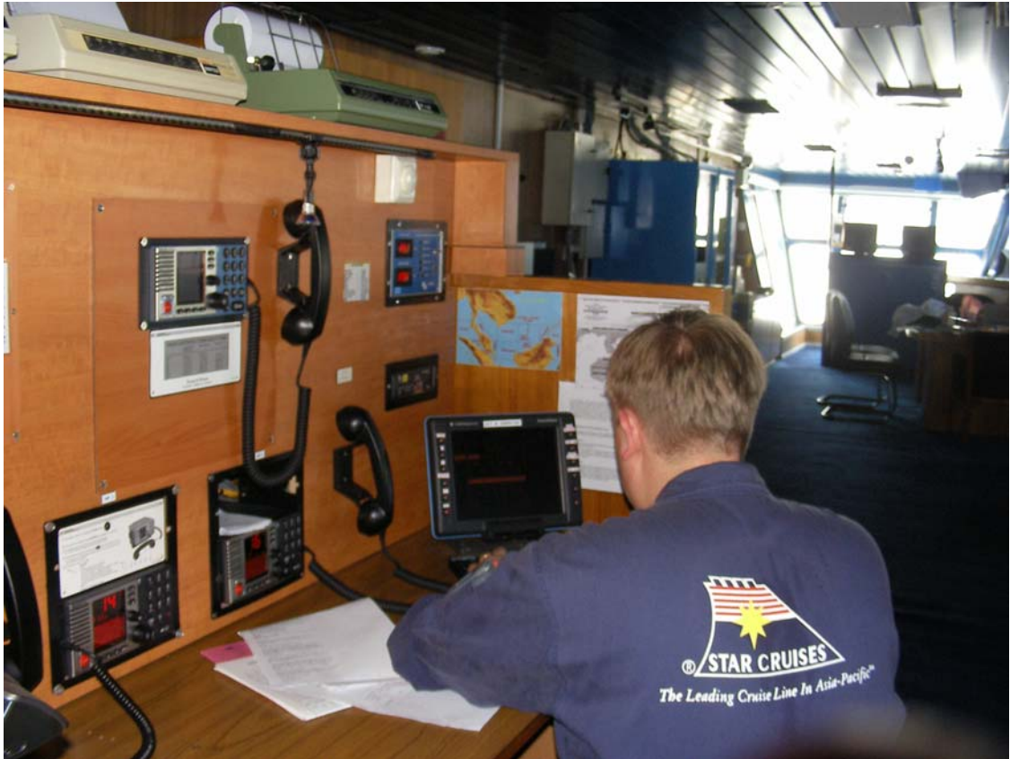
Figure 2. Officer sending ship weather report via the Inmarsat C terminal on board a Hong Kong Voluntary Observing Ship